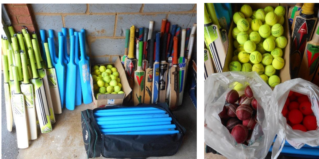
Sort & Pack Day October 2015

In early September the kit will be taken from Lincoln to base camp in Tilehurst to start the sorting and packing process.